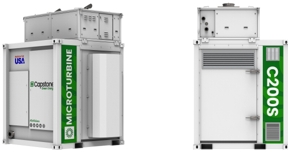
C200S ICHP Microturbine

The Signature Series Microturbine provides reliable electrical/thermal generation from natural gas with ultra-low emissions.