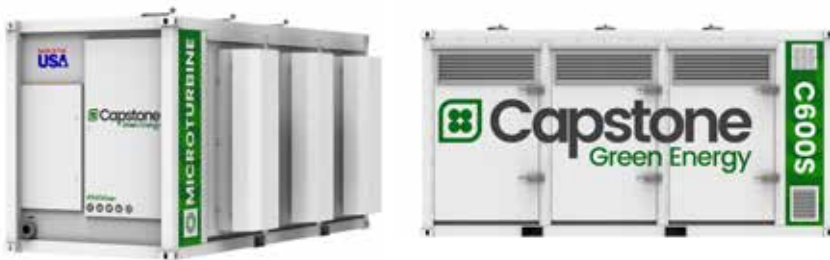
C600S Power Package

The Signature Series Microturbine provides 600kW of reliable electrical power in one small, ultra-low emission, and highly efficient package.