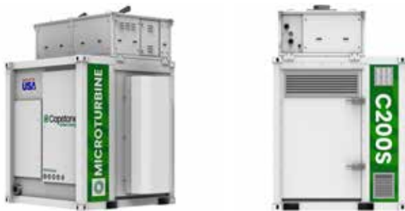
C200S ICHP Microturbine

The Signature Series Microturbine provides reliable electrical/thermal generation from natural gas with ultra-low emissions.